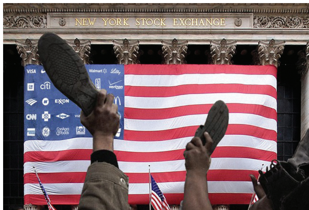
CHOOSE. BUT CHOOSE FAST. THE STATE AND CORPORATE FORCES ARE DETERMINED TO CRUSH THIS.

If you do not shake off the 1% very, very soon they will kill you. And they will kill