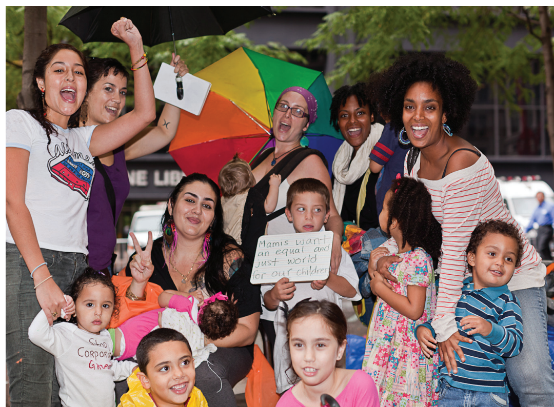
WE'RE ALL IN THIS: The occupation has spread beyond its first days to include an increasing number of families, local union workers, teachers and students from across the five boroughs.

corporate tax dodger bankrupting our econ