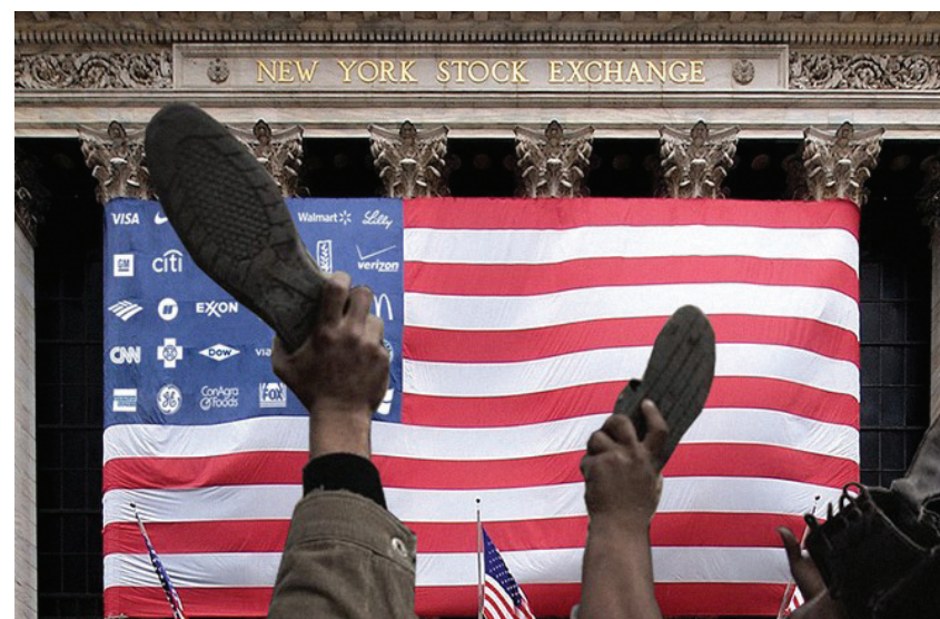
Daily marches around Wall Street have launched a movement. Graphic: Adbusters

The Wall Street occupation has succeeded in revealing how corporations, politicians, media and police have failed us as institutions offering something positive to humanity. Our current leaders tell us they will spread the financial pain by imposing the "Buffett Rule," a tax increase that asks the wealthy to sacrifice the equivalent of a tin of caviar per year.